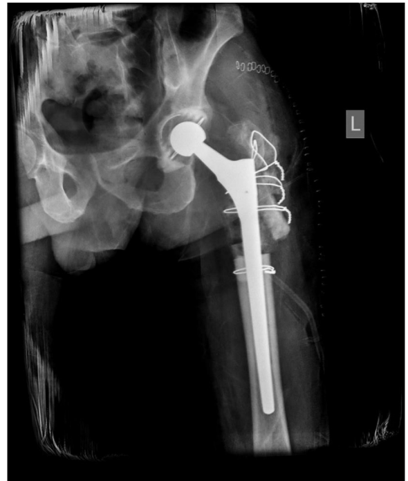
Figure 3. Immediate postoperative pelvis radiograph showing a satisfactory fit of the distally fitted uncemented femoral stem.

Limb length discrepancy was managed with implant offset and correcting the center of rotation of the hip. The postoperative radiographs were judged satisfactory with a well-fitted distal stem (Fig. 3). Physiotherapy began on day 1 postoperatively and continued further. He was discharged with medication, including a subcutaneous injection of enoxaparin to prevent venous thromboembolism.