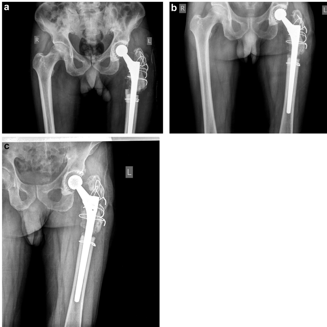
Figure 4. Follow-up pelvis radiographs showing good osteointegration and gradual bony union. (a) Postoperative anteroposterior radiograph at the end of 6 weeks. (b) Postoperative anteroposterior radiograph after 1 year. (c) Postoperative anteroposterior radiograph after 2 years.

neglected posterior traumatic hip dislocation by open reduction after skeletal traction. They found excellent outcomes in 17 children despite varying degrees of avascular necrosis [7]. In a study of 755 constrained THAs, 10% were primary hip replacements in patients with abductor dysfunction that reported promising results. This indicates constrained THA can be a viable alternate surgical choice with abductor dysfunction [8]. A 5-month-old anterior hip dislocation was treated with a modified girdle stone operation by Alva et al. [3]. The patient had a relatively stable hip with a satisfactory range of motion. Furthermore, Kumar et al. [1] successfully treated 2-year-old hip dislocation by THA with subtrochanteric osteotomy.