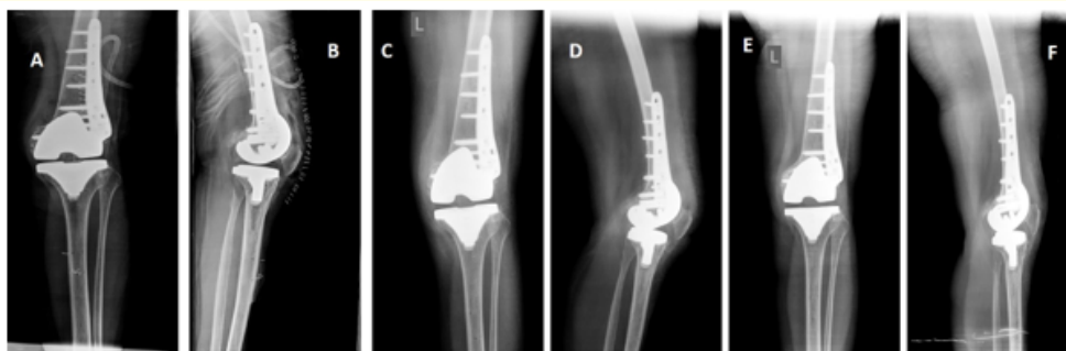
Figure 3: Follow-up radiographs showing good fracture union with no malunion or knee deformity (A) Immediate post-operative anteroposterior radiograph (B) Immediate post-operative lateral radiograph (C) Post-operative anteroposterior radiograph at the end of 6 weeks (D) Post-operative lateral radiograph at the end of 6 weeks, (E) Post-operative anteroposterior radiograph at the end of 3 months (F) Post-operative lateral radiograph at the end of 3 months.